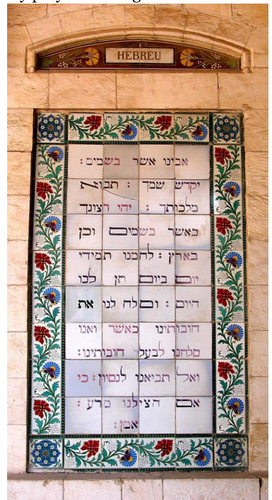
The Lord's Prayer in Hebrew, Pater Noster Church, Jerusalem

Photos to accompany this text can be seen at jrsmithblog.wordpress.com